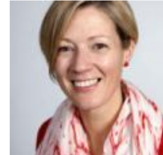
Ils de Bal Board member, BE